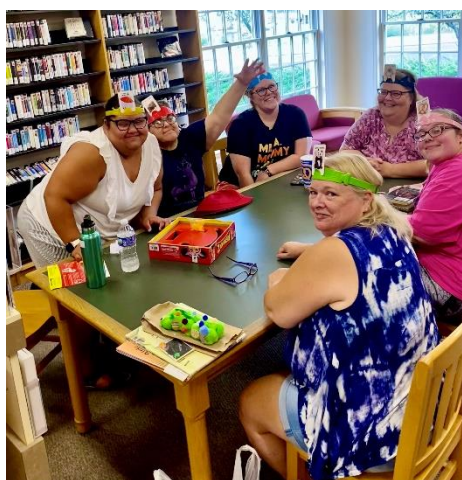
Playing 'Hedbanz' and creating worry dolls together!