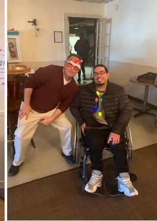
We had a wonderful time at our holiday party!