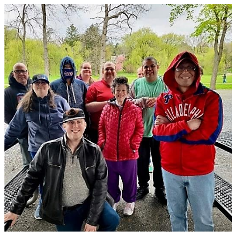
The Allentown crew visited a rose garden!